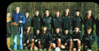
ST CLEER FOOTBALL CLUB

If we as a Company can encourage this success, we all need to support the next generation.