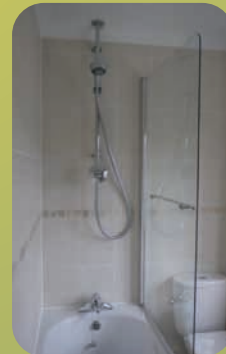
Design by Tee Design: tee-dp.com