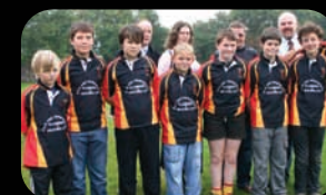
SALTASH RUGBY CLUB

We as a Company have found that following our involvement with youth groups, the youth groups have taken pride in who they represent and what they do.